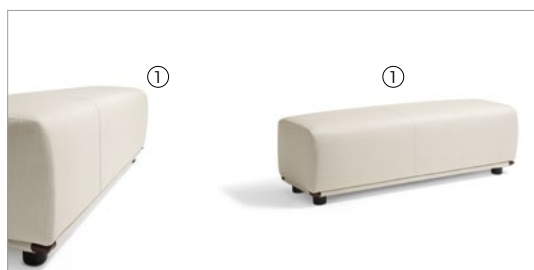
1 Adam (80219 + 80506) penny 6704 fin.5L